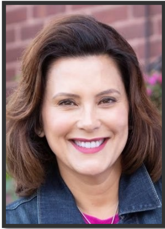
Gretchen Whitmer (D)

The Coalition of Labor Union Women encourages you to vote for the candidate that best represents your values and the needs of working women and families!