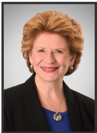
Debbie Stabenow (D)